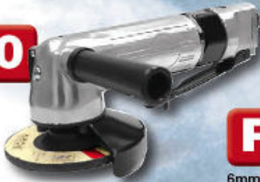
115mm Angle Grinder • 6.5 Bar FAB1340