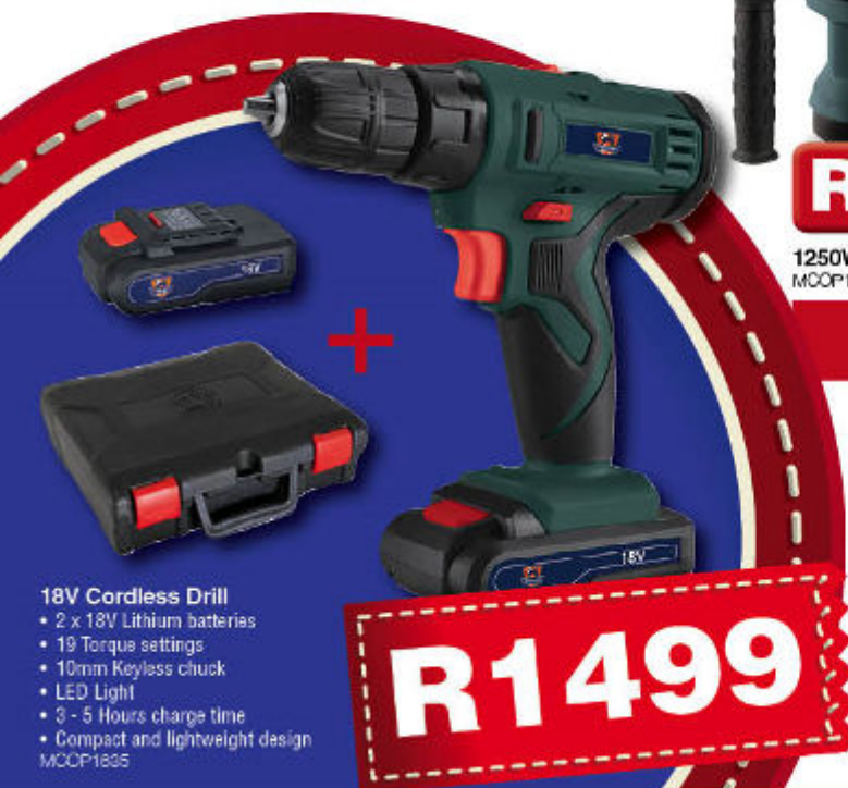
18V Cordless Drill • 2 x 18V Lithium batteries • 19 Torque settings • 10mm Keyless chuck • LED Light • 3 - 5 Hours charge time • Compact and lightweight design MCOCP1835