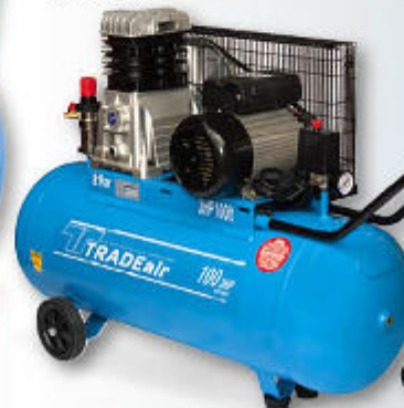
100L 2.2kW Compressor MCFFC282