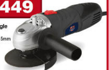
850W Angle Grinder • Disc Ø: 115mm MCOCP1580