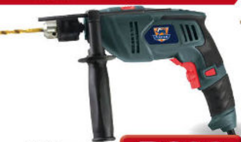
710W Impact Drill MCOCP1501