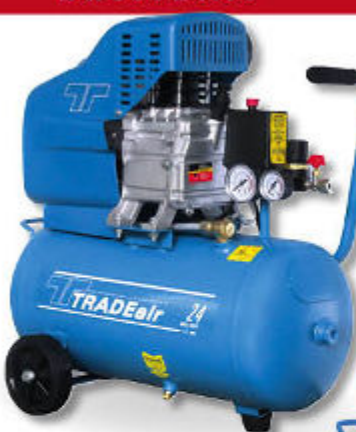
24L 1.1kW Compressor MCFFC100