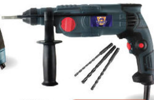
550W Rotary Hammer Drill MCOCP1503