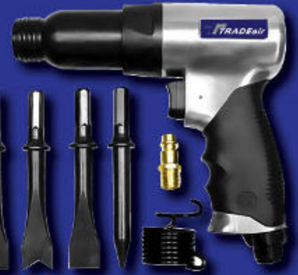
Chipping Hammer Set • 3000 blows / min PAB1320