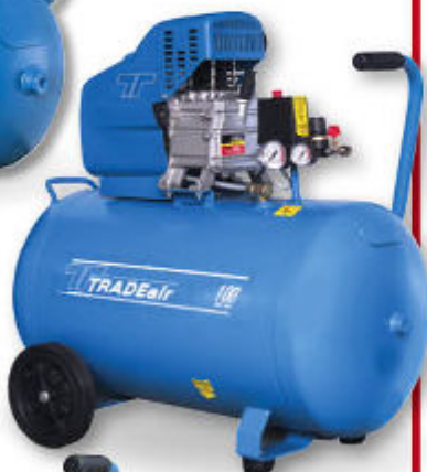
100L 1.8kW V-Head Compressor MCFFC113