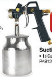
Suction Spray Gun • 1 Cup, 1.5mm nozzle PAB1207