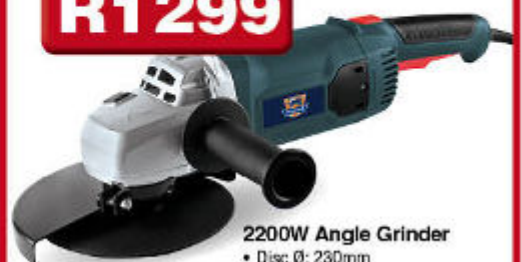
2200W Angle Grinder • Disc Ø: 230mm MCOCP1627