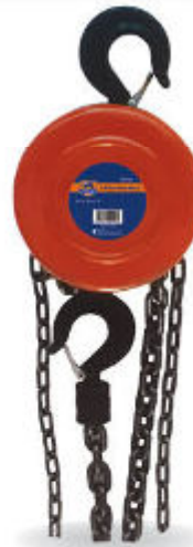
1/2 Ton Chain Block • 2.5m lift TOOC236