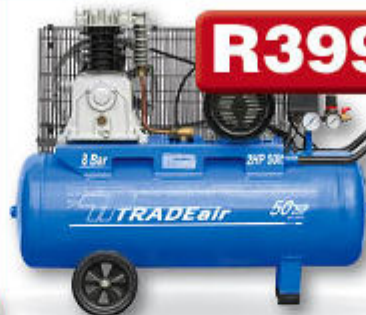
50L 1.5kW Compressor MCFFC230