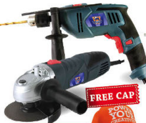
500W Drill & 650W Angle Grinder Combo ANGLE GRINDER: • Disc Ø: 115mm MCOCP1504 FREE FRAGMENT CAP