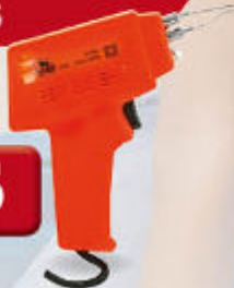
Soldering Gun • 100W TOCS1694