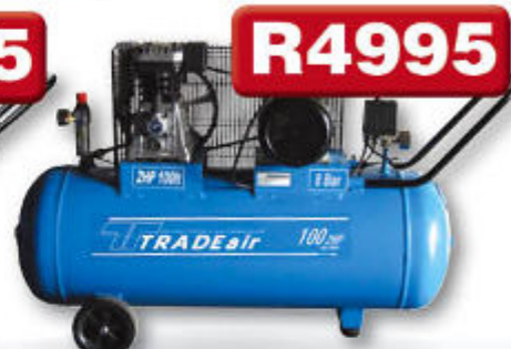
100L 1.5kW Compressor MCFFC201