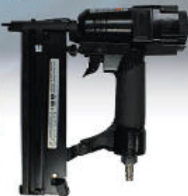
Finishing Nailer • Nails: 15 - 50mm, 6 Bar PAB1352