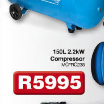
150L 2.2kW Compressor MCFFC233