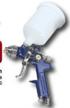
Gravity Feed Spray Gun • 0.6 Cup, 1.4mm nozzle TCOS1769