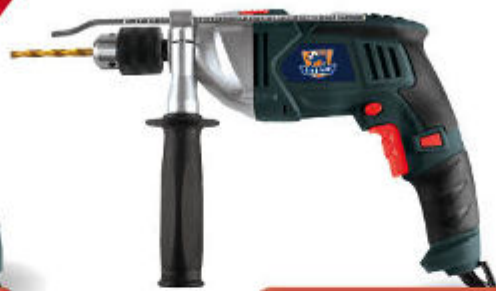
900W Impact Drill MCOCP1502