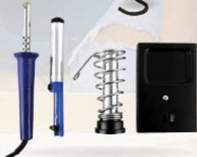
4Pc Soldering Iron Kit • 30W TOOS1695A