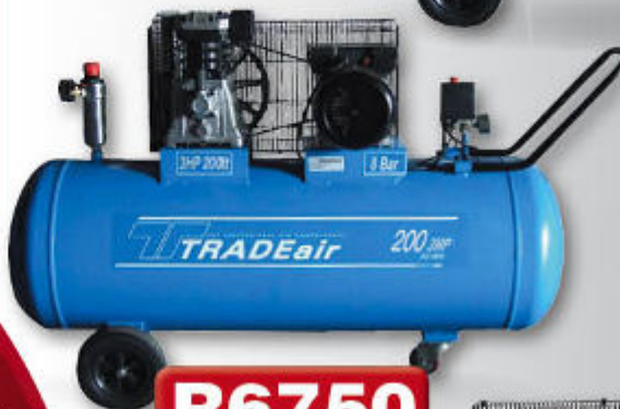
200L 2.2kW Compressor MCFFC284