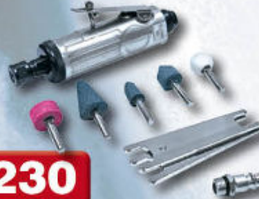
6mm Die Grinder • Includes 5 x 6mm moulded stones, 2 x hand wrenches, connecting nipple PAB1360