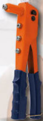
Hand Riveter Kit TOCR1485