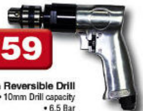
10mm Reversible Drill • 10mm Drill capacity • 6.5 Bar PAB1300