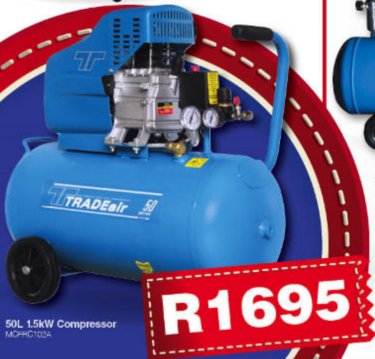
50L 1.5kW Compressor MCFFC102A