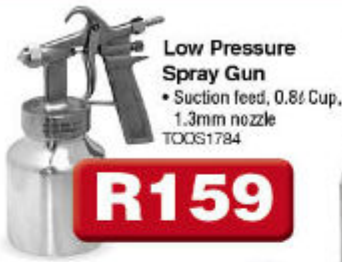
Low Pressure Spray Gun • Suction feed, 0.8 Cup, 1.3mm nozzle TOOS1784